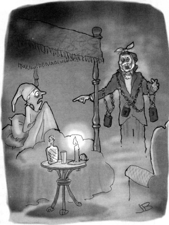
"At the stroke of midnight you will be visited by three spirits! And if that doesn't work—two guys from AA!"